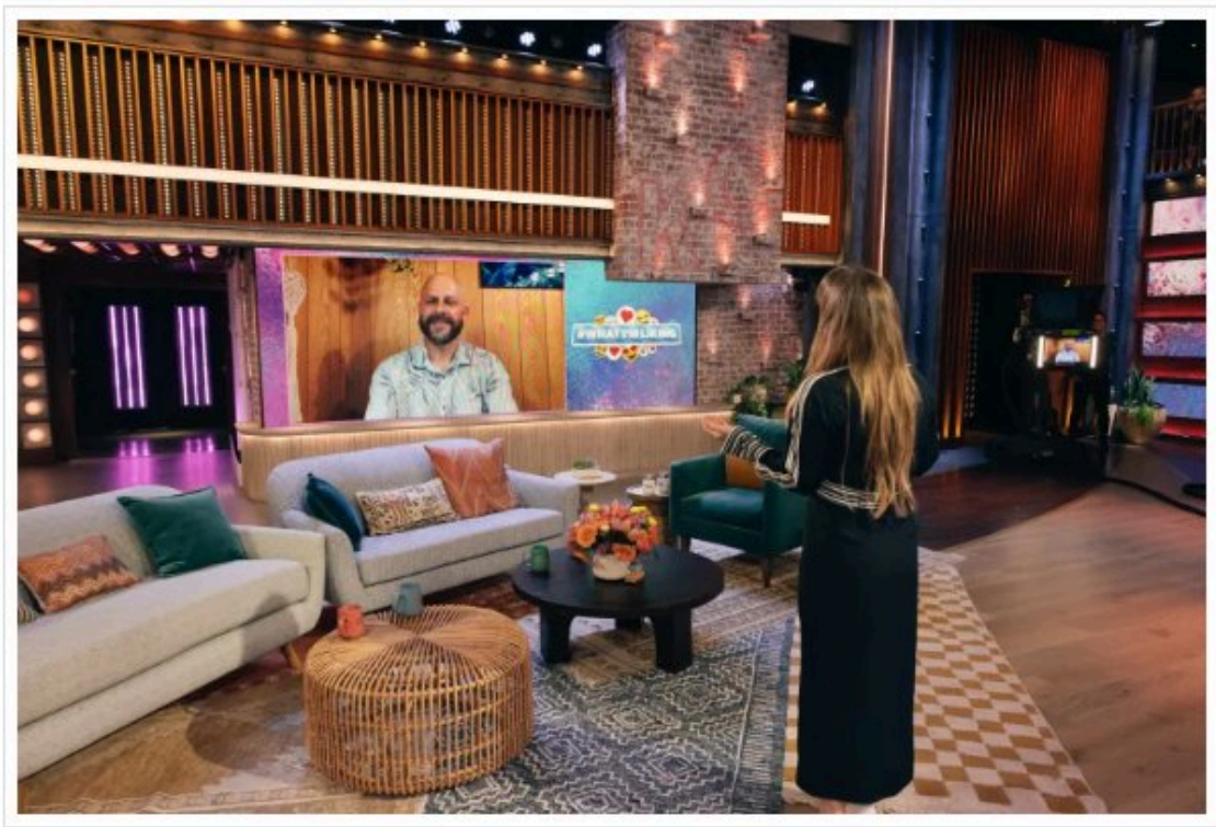
— THE KELLY CLARKSON SHOW — Episode 71131 — Pictured: (l-r) —