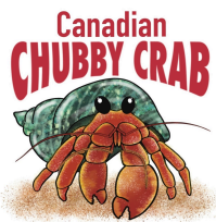
Canadian Chubby Crab