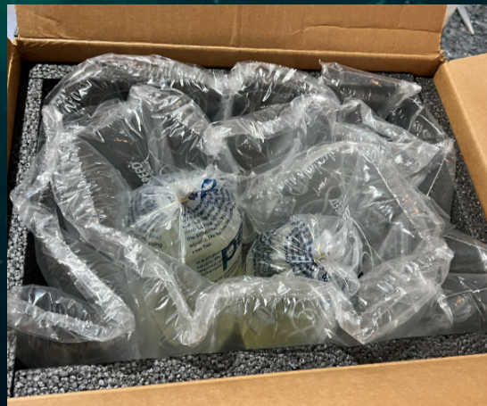
Shipping zoeae by Jamie H