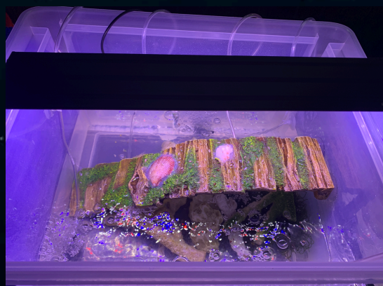
land transition tank by Stacy Boltz