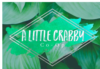
A Little Crabby Co-Op