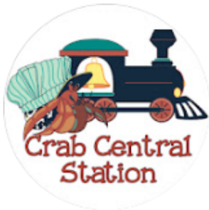
Crab Central Station